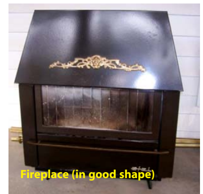
Fireplace (in good shape)