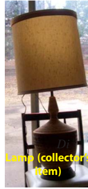
Lamp (collector's item)