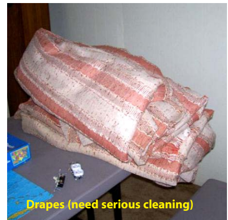
Drapes (need serious cleaning)