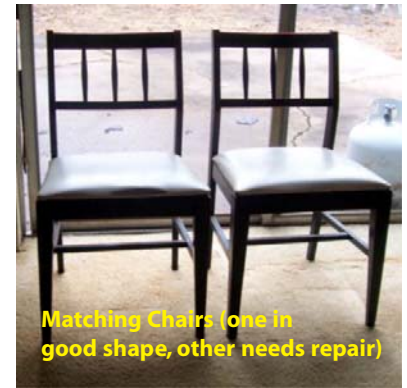
Matching Chairs (one in good shape, other needs repair)